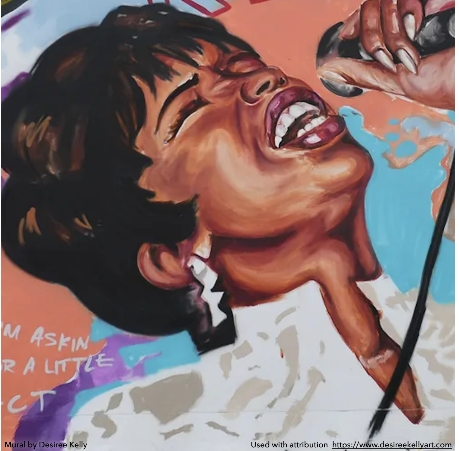
Mural by Desiree Kelly

Used with attribution https://www.desireekellyart.com